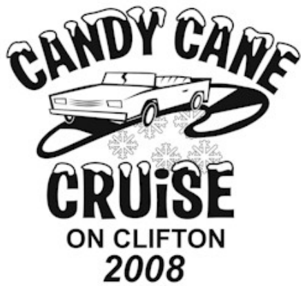
PHOTO ORDER FORM

To order your souvenir photo from the 2008 Candy Cane Cruise on Clifton simply fill out this form and: